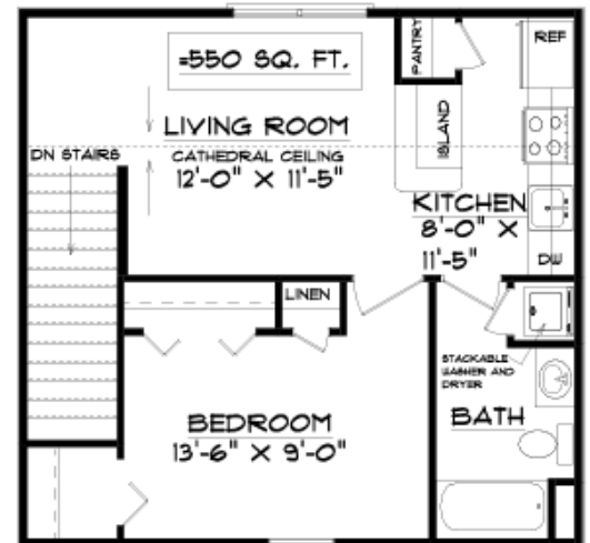
2ND FLOOR UNIT